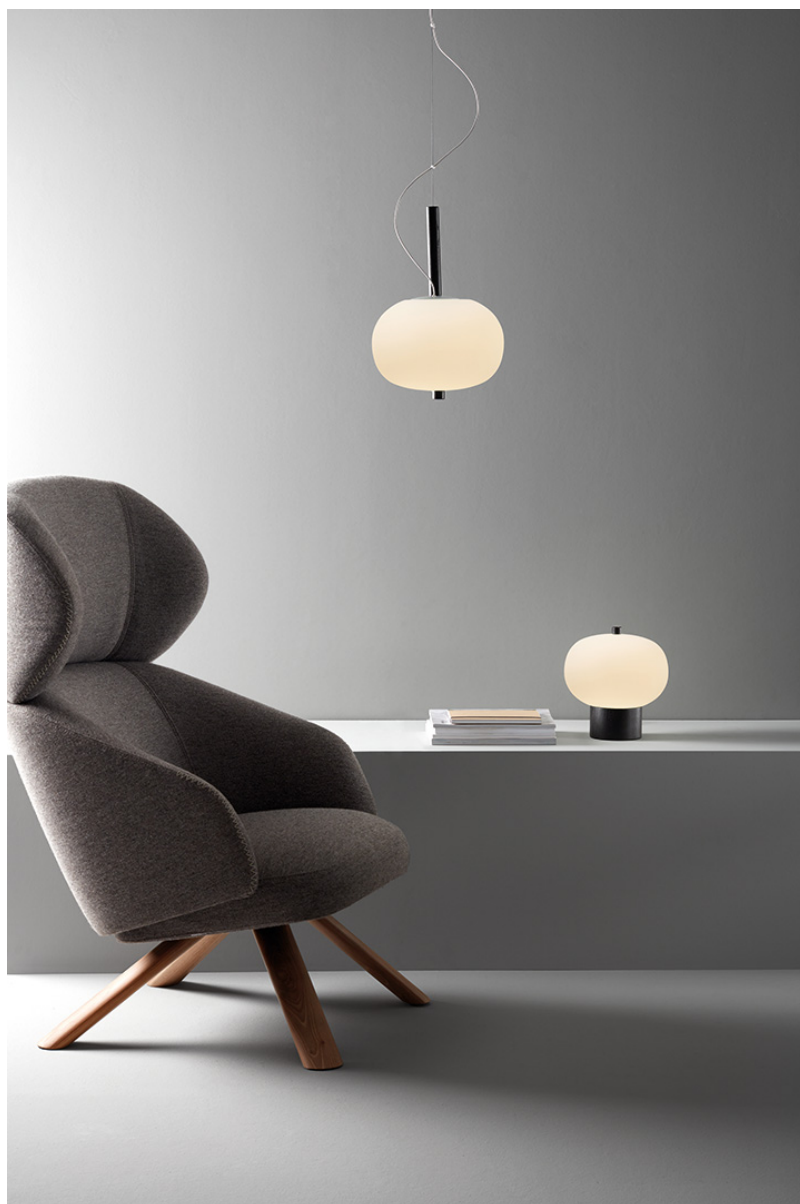
Image may not match reference. LedsC4 reserves the right to amend any of the product's components. The data related to flux, power and colour temperature may be subject to changes made by the manufacturer.